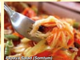
Papaya Salad (Somtum)