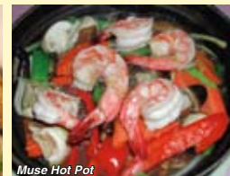
Muse Hot Pot

🌶️ Mild 🌶️🌶️ Medium 🌶️🌶️🌶️ Very Spicy Spice Levels can be altered to suit your taste.