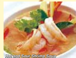
Hot and Sour Shrimp Soup