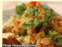
Three Flavored Shrimp